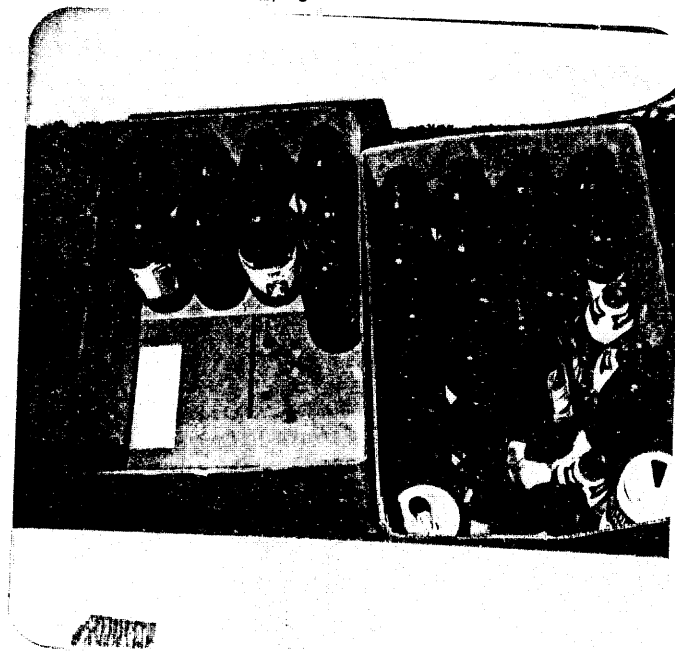
For those who doubted our bathtub story