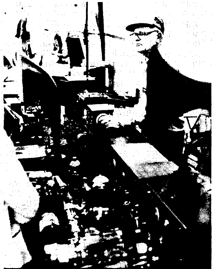
WOODY'S OLD-TIME RADIOS AUCTION TIME!