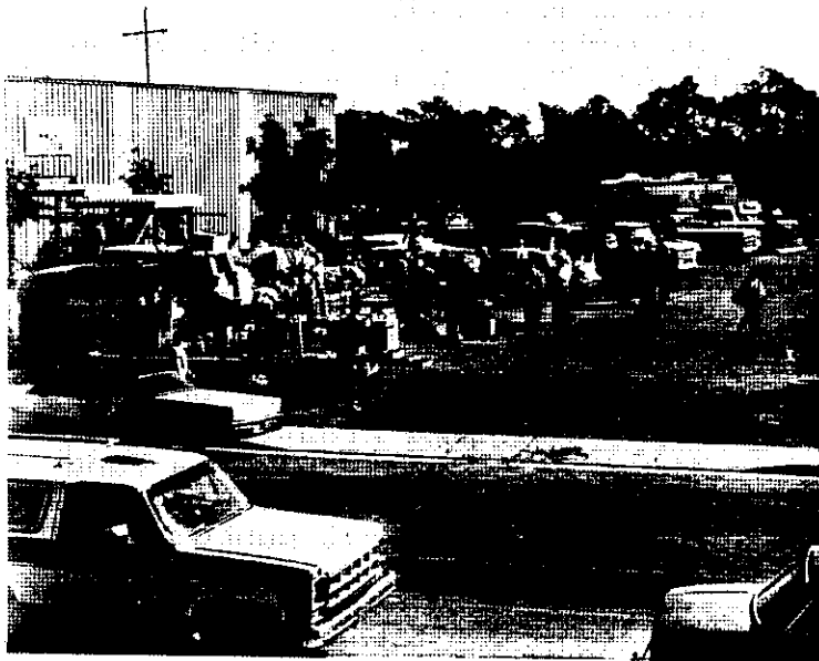
LATE VENDORS SET UP OUTSIDE RADIO CLINIC