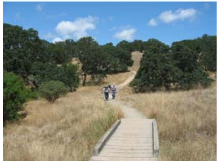
Heading down off the hill