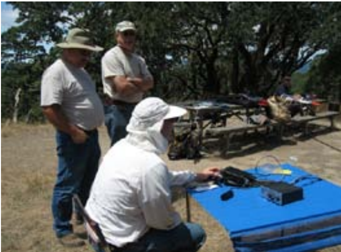
WB6FRZ on 40m CW QRP