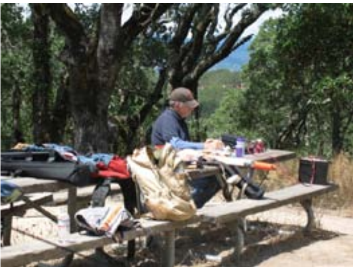
W1EJ on 20m CW