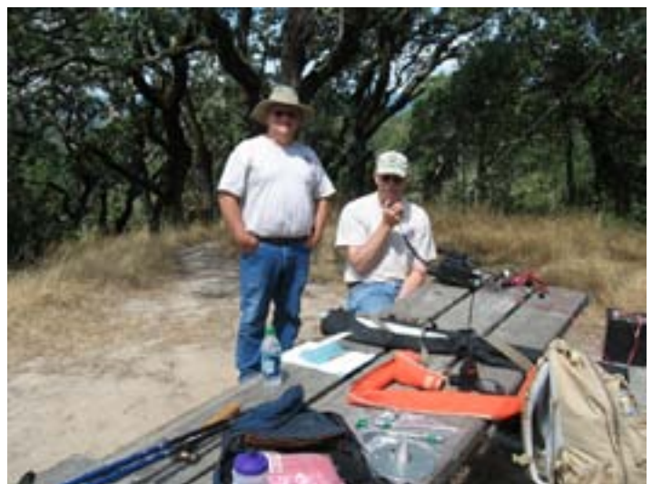
KI6TUR & KG6ZDN