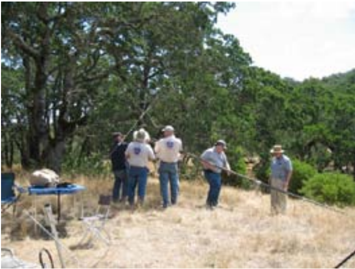
Erecting the Buddie Stick